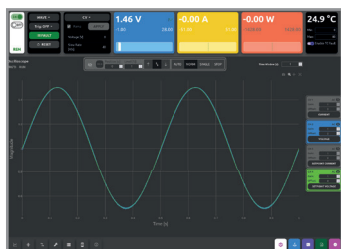
Embedded Web-Server with AWG and OSCILLOSCOPE